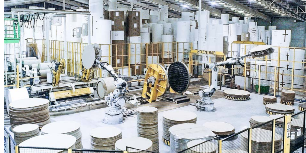
Paper wrapping at the end of the line