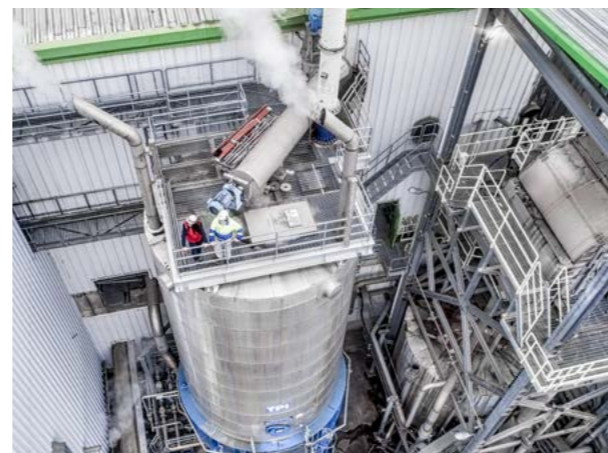
ANDRITZ PHC bleach tower with MC discharge